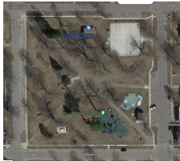
1 Wayland City Park - Within the boundaries of the City Park on the sidewalks.