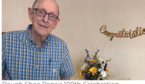
Baugh Shoe Repair 100th Celebration