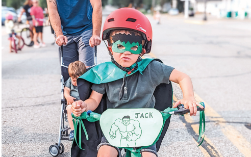
Block Party, Bike Parade