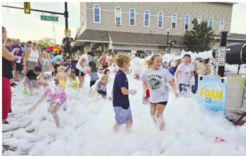
Block Party's Foam Party