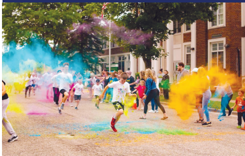
Summerfest Annual Color Run