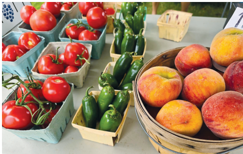
The Farmers Market